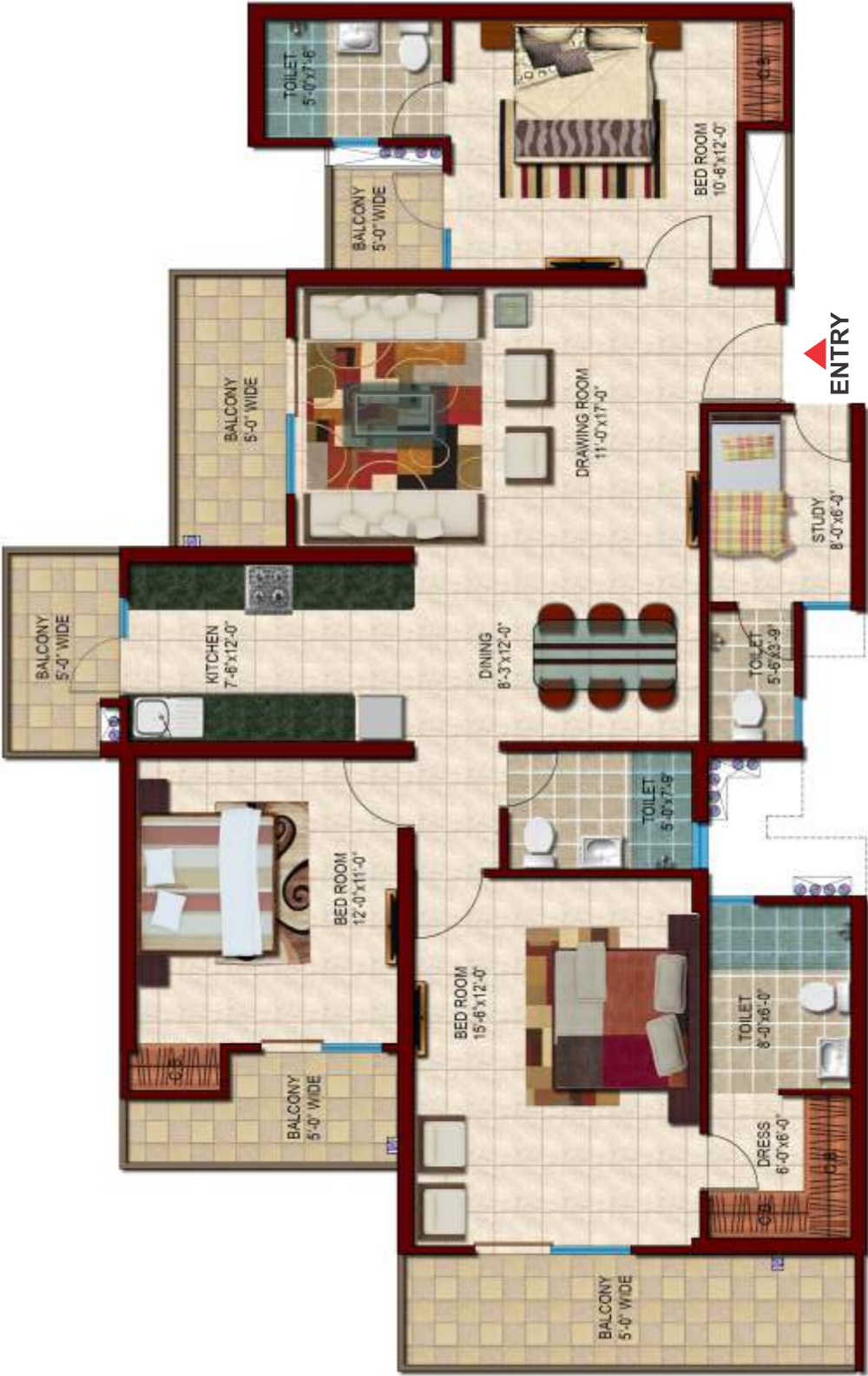
3 BEDROOM + 4 TOILET + STUDY

Carpet Area 92.62 Sq.mt. / 996.95 Sq.ft. Builtup Area 119.53 Sq.mt. / 1286.64 Sq.ft. Super Area 152.82 Sq.mt. / 1645.00 Sq.ft.