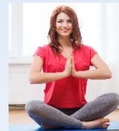
Yoga / Meditation