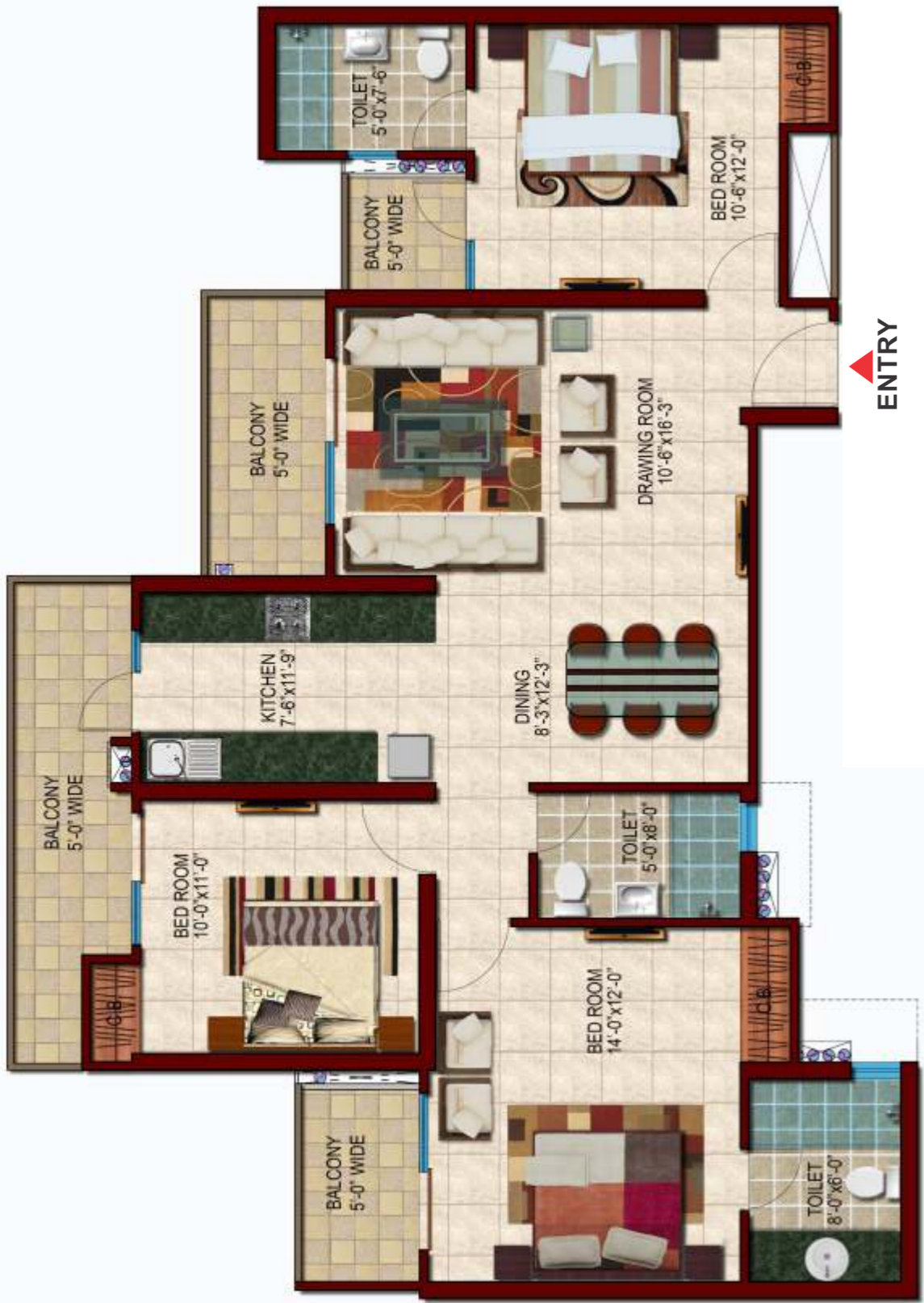
3 BEDROOM + 3 TOILET

Carpet Area 92.62 Sq.mt. / 996.95 Sq.ft. Builtup Area 119.53 Sq.mt. / 1286.64 Sq.ft. Super Area 152.82 Sq.mt. / 1645.00 Sq.ft.